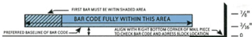
(Bottom Edge of Envelope)

Also available in standard window 1 x 4. Position from left, 1"; from bottom, 3/4"